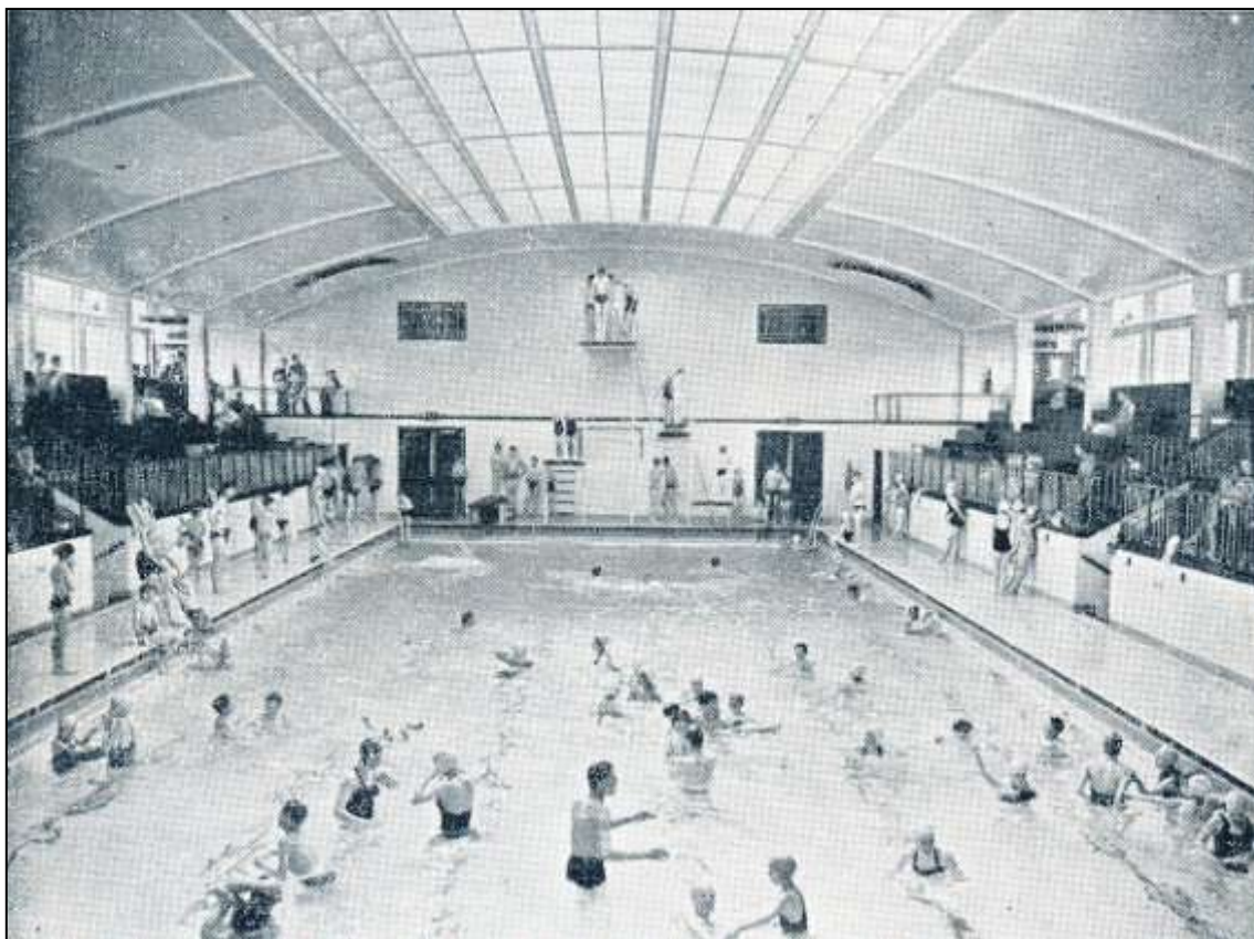
The Swimming Pool

The Superintendent and Manager will always be pleased to arrange for parties of people to visit the various sections of the Department.